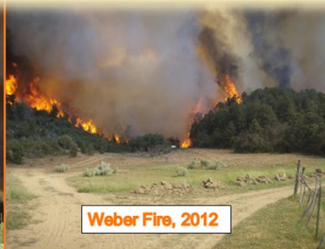
Weber Fire, 2012