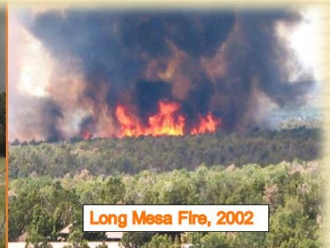
Long Mesa Fire, 2002

Celebrate National Wildfire Community Preparedness Day and Remember the Fires that have Impacted Our Communities!