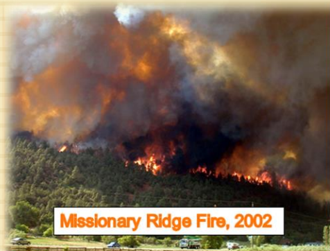
Missionary Ridge Fire, 2002