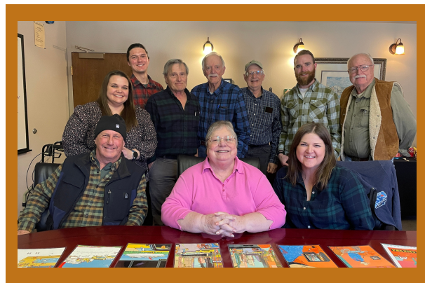
WAP Board and Staff: January 2024

We thank you for your continued support in our efforts to protect lives and property from wildfire.