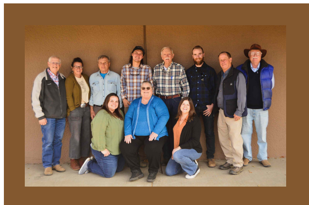
WAP Board and Staff: Fall 2023

We thank you for your continued support in our efforts to protect lives and property from wildfire.